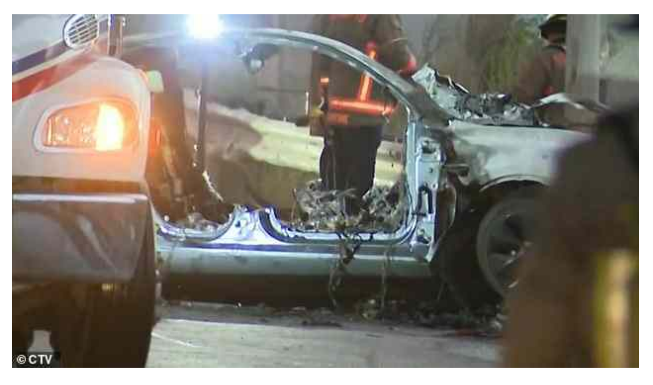
A 2024 Tesla collided with a guard rail and then a concrete pillar before exploding in downtown Toronto, in Canada, early Thursday morning - taking the lives of four people